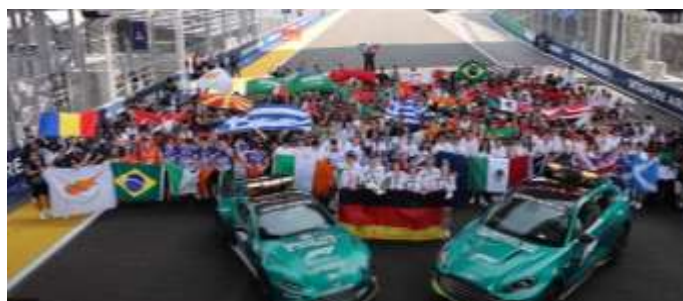
F1 Finals in Singapore, 2023