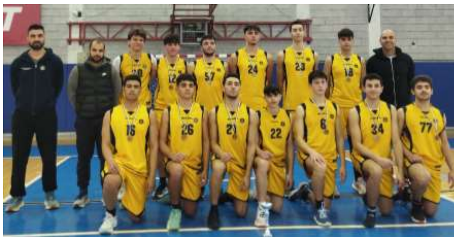
Senior Boys Basketball Team

The sporting ECA timetable provides a summary of both the School Teams as well as the Sports Clubs opportunities that are available to our students for 2024-2025: