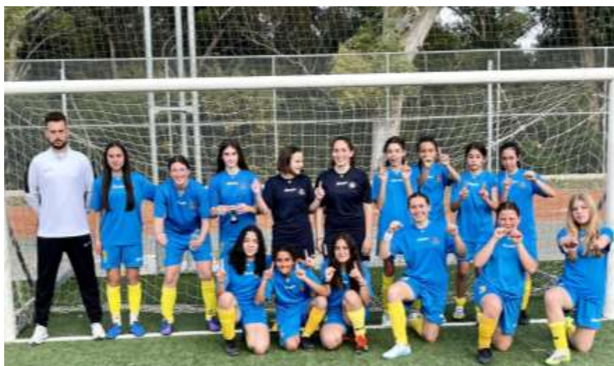
U15 Girls Football Team

We aim to challenge and develop our top athletes through high level competition, but we also try to provide opportunities to every student to take up a sport in order to stay healthy and have fun!